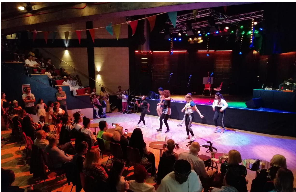
Refugee Awareness Week event at ARC