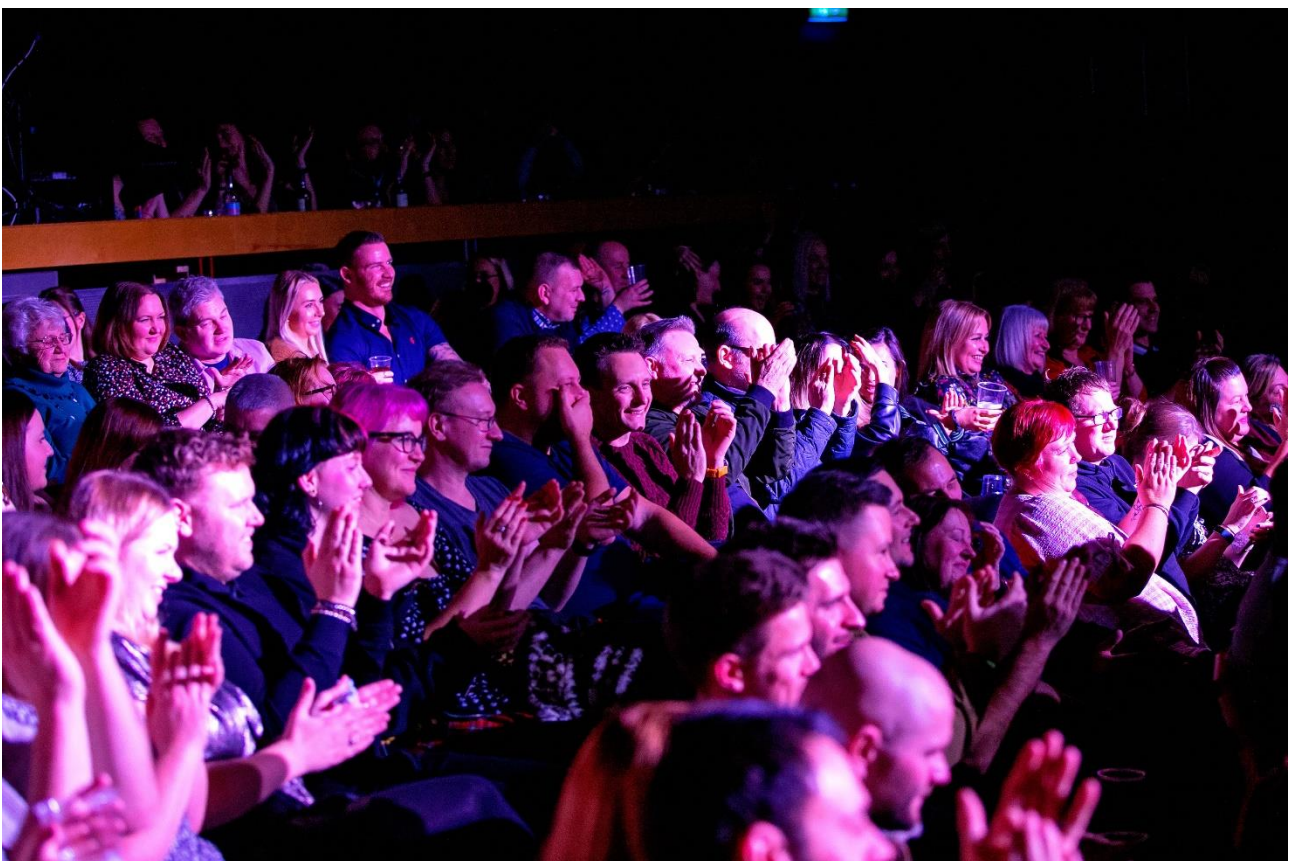
Audiences at a comedy event in The Point at ARC

In 2023, we will be recruiting a new Chair of the Board of Trustees, advertising widely, and existing Board members will be able to apply.