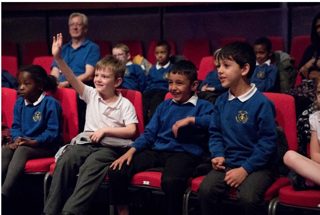
Children from Mill Lane Primary School at ARC

This creates better connections across communities which support people to raise their aspirations, achieve their potential and enhance their experience of the world.