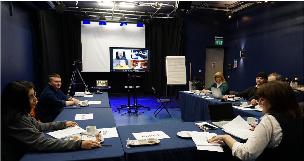
ARC Board meeting