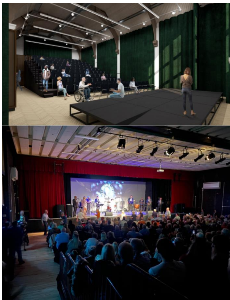
Render of Rochdale Studio (top), Heywood (below)